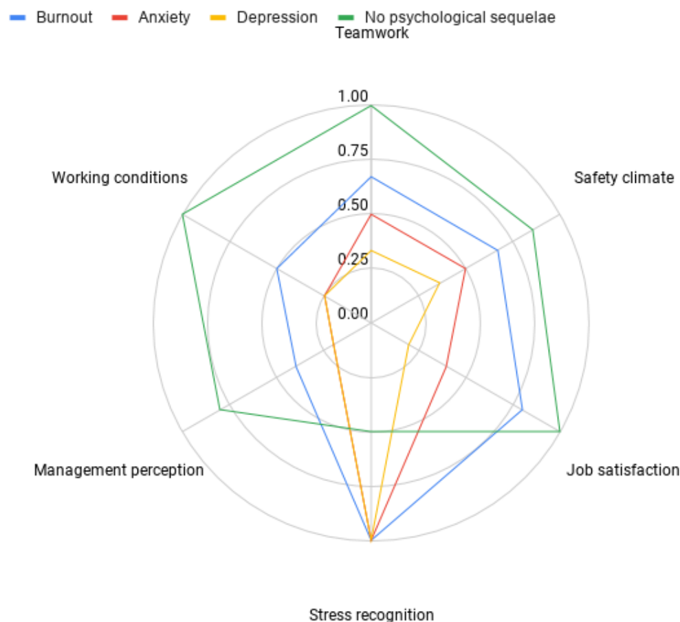
Figure 2 Radar plot demonstrating SAQ subscale by psychological state

This figure demonstrates the SAQ subscale scores by psychological outcome. Distance from the centre represents proportion of a subscale answered positively. A greater distance represents a more positive score.