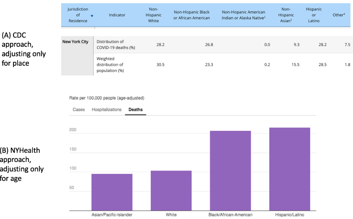
Figure 1. Conflicting indicators of COVID-19 mortality by race/ethnicity in New York City. Mortality adjusted for geographic distribution is represented by panel A, taken from the CDC webpage for provisional COVID-19 death counts by race/ethnicity on May 18, 2020 [1]. Mortality adjusted for age distribution is represented by panel B, taken from the New York City DOHMH COVID-19 webpage [2].

Place adjustment and age adjustment tend to work in opposite directions and either approach in isolation is potentially misleading. This divergence in results can be seen in Fig. 1 for New York City, the primary center of COVID-19 infection in the United States. Geographic