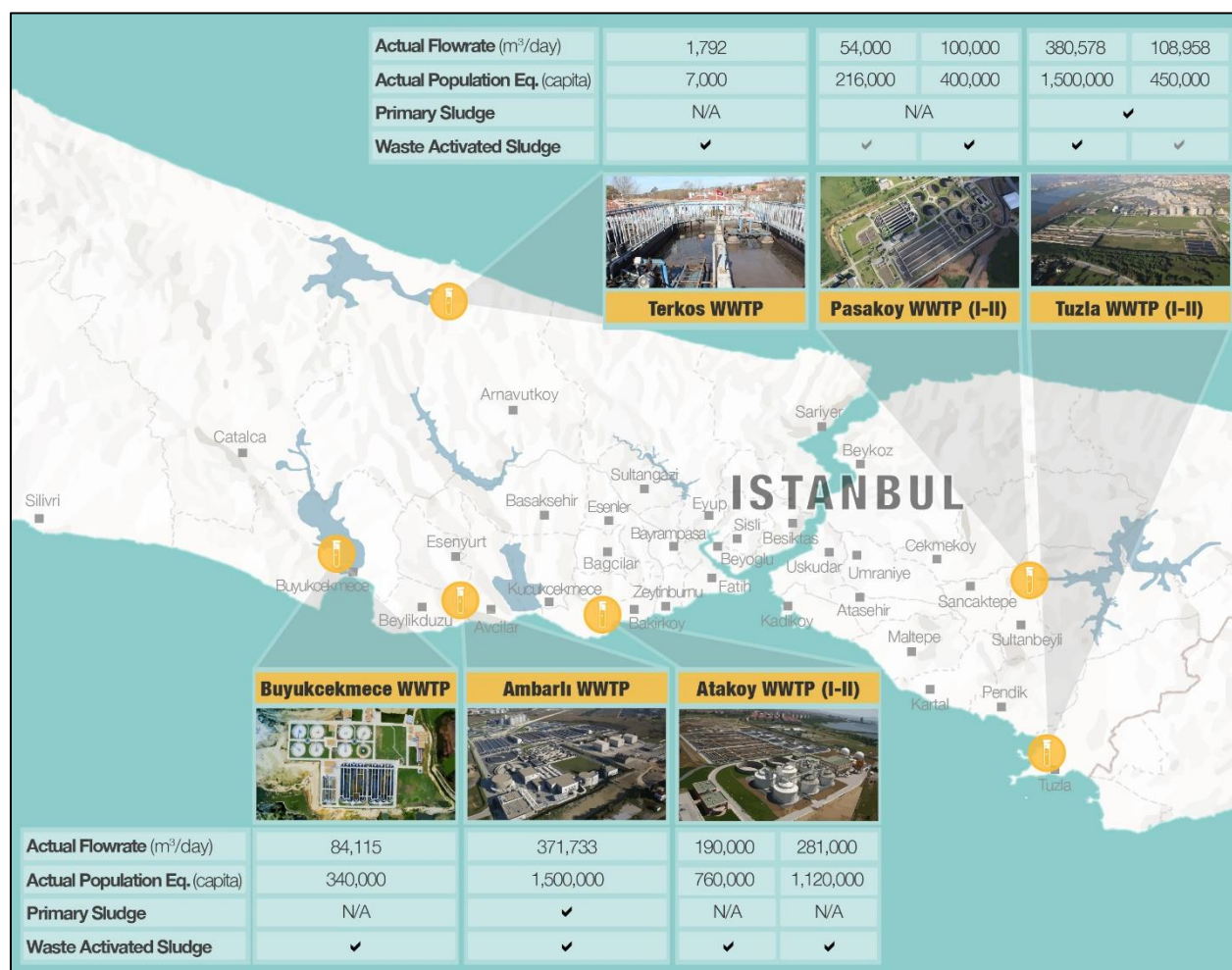
Figure 2. Primary and waste sludge sampling WWTPs in Istanbul

The flowrates received by the WWTPs during 7 th of May 2020 are listed in Table 2. During the time of sampling (7 th of May, 2020), most of the industrial and commercial sites were shut down due to restrictions and the wastewater received by the plants were mostly domestic wastewater. The equivalent population served by the treatment plants was estimated using the 250 liters per day per capita value advised by İstanbul Water and Sewerage Administration (İSKİ). The hydraulic retention time (HRT) and the sludge retention time (SRT) values of the WWTPs during the day the sludges were sampled are presented Table 3. HRT values were added to the table since they show the approximate washout time of the influent. The SRT values indicate whether the sludge is stable during the time of sampling.