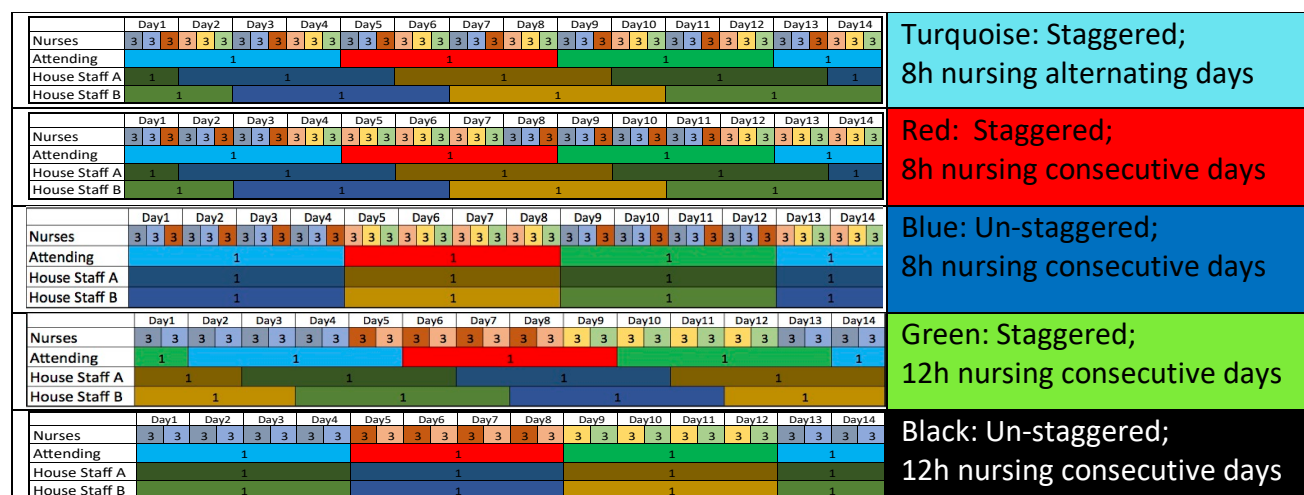
Figure 1. Probability of team failure based on Monte Carlo simulations plotted by duration of physician rotation, modeled for a team caring for patients with five-day average hospitalizations with fewer patients per nurse, such as internal medicine wards (Figure 1A left) or for patients with two-day average hospitalizations and more patients per nurse, such as maternity wards (Figure 1A right.) The plots compare the probability of team failure for five different scheduling designs. The scheduling designs are depicted in the schematic diagrams (Figure 1B) for a schedule with 18 nurses, 3 attending physicians and 6 house-staff with physician rotations duration of four days. The designs simulated vary by whether they are staggered versus un-staggered, whether they have 8-hour nurse shifts versus 12-hour nurse shifts, and whether nurses work consecutive days versus work alternating days. Note that in our simulations with nurses working consecutive days, when the physician rotations are sufficiently short, the nurses work the same number of consecutive days as the physician do; however, if the physician rotations are too long, the nurses are scheduled to work as many consecutive days as possible without exceeding 48 hours of work in the span of one week, and without exceeding 36 hours/week on average. Of note, due to unknown variables in the model, these plots do not suggest that the actual probability of team failure lies in the 20-60% range, but rather the plots are intended to demonstrate the relative improvement of various staff scheduling changes. From the plots in Figure 1A, and from similar plots that we generated with varying choices of the unknown parameters, we observe that scheduling designs with un-staggered rotations, 12-hour nursing shifts over consecutive days are favorable, and further, the probability of team failure is lower when all HCWs work at least 3-4 consecutive days. Figure 1B illustrates five designs for the case where the physician rotation duration is four days. Each physician is represented by a unique color. In each shift there are three nurses (triplet). The identity of the nurses in each triplet is fixed as long as all nurses in the triplet are healthy. Each triplet is represented by a unique color. The right column in Figure 1B describes the different schemes and also serves as the legend of Figure 1A.