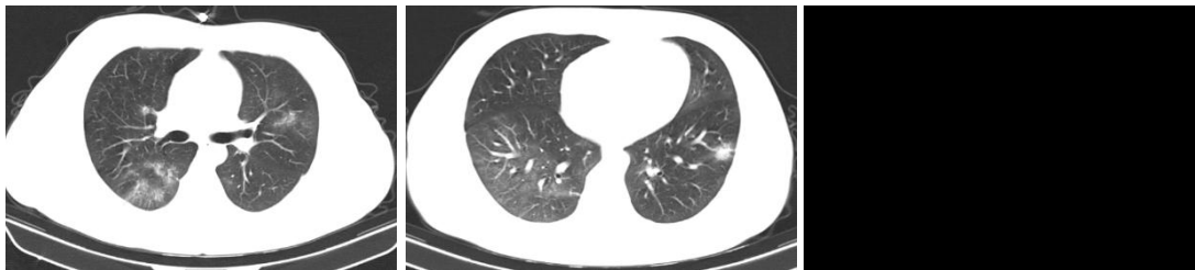
Fig2. Chest CT images of a 26-year-old patient with COVID-19. a Chest CT images obtained on February 2, 2020, showed ground glass opacity in both lungs on day 5 after symptom onset. b Images taken on February 12, 2020, indicated the lesions increased obviously. c Images taken on February 19, 2020, revealed bilateral ground glass opacity absorbed dramatically, and the patient discharged from hospital and return to the local hospital.