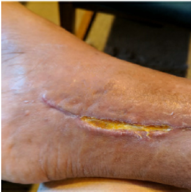
Figure 2. Minor wound complication. This is a patient with skin necrosis which ultimately led to cellulitis requiring short-term IV antibiotics, and was characterized as a minor complication. This patient did not require reoperation.

Additionally, for metastatic patients shortening the treatment course allows quicker resumption of systemic therapy. Patients will also have reduced less absences from work and quicker resumption of activities of daily living.