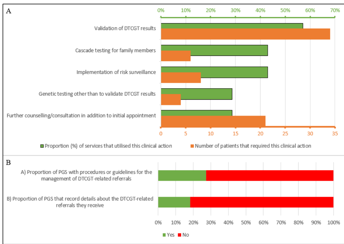
Figure 2: A) Additional clinical actions required following patient appointments resulting from DTCGT-related referrals (n=11). B) Procedures for the management and collection of information regarding DTCGT-related referrals (n=11). Abbreviations: DTCGT = direct-to-consumer genetic testing.