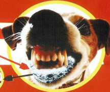
Virus de la Rabia

El virus se encuentra en la SALIVA de los perros con Rabia.