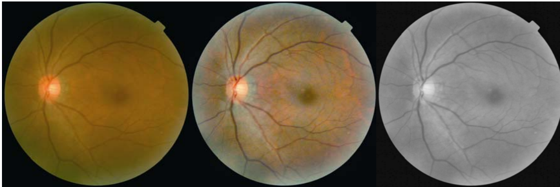
Figure 1. Right: original image; Middle: Enhanced image; Left: grayscale image

dimension 1496 \times 1496 , in order to scale the images without distortion. All images were resized to 256 \times 256 , and rescaled pixel values (between 0 and 255) to the [0, 1] interval. To highlight the retinal vasculature, two image enhancement methods, gamma correction and contrast limited adaptive histogram equalization, were conducted to enhance the image contrast (Fig. 1). In addition, another dataset was generated by converting all 3-channel color images to the grayscale ones (Fig. 1).