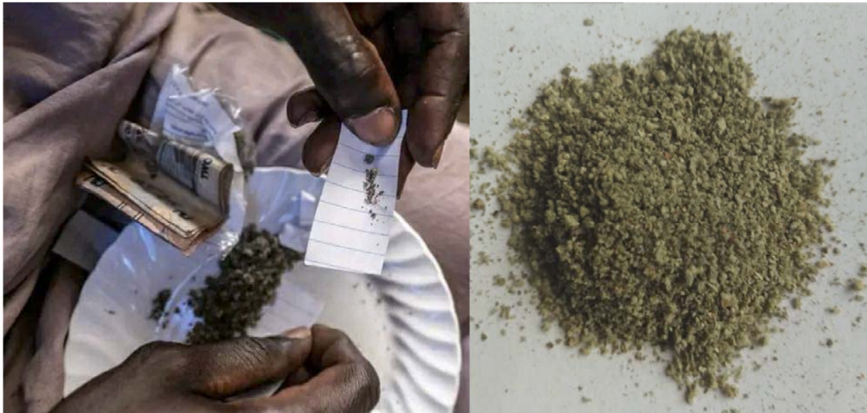
Figure 2A: Jagaban Kush(High Intensity Kush)

sleep after a hectic day." When I'm tired, it's my favourite." It would appear from this that some young people take kush for energy, whereas others use it for relaxation and sleep. There are significant risks associated with certain forms of kush. A 26-31-year-old warned about the hazards of "Tramadol kush," adding, " Seeing someone vomit blood after using 'Tramadol kush' is alarming ". It shows how harmful it may be. This highlights the serious health concerns associated with taking specific types of kush, demonstrating that it is not always harmless.