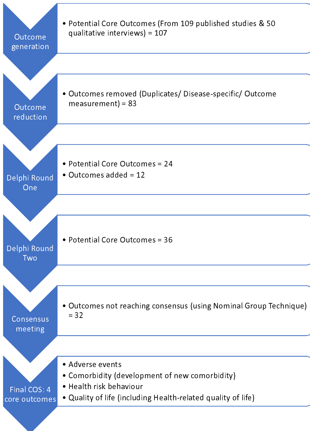
Figure 1a. Development of COS for trials of interventions to prevent multimorbidity in LMICs.