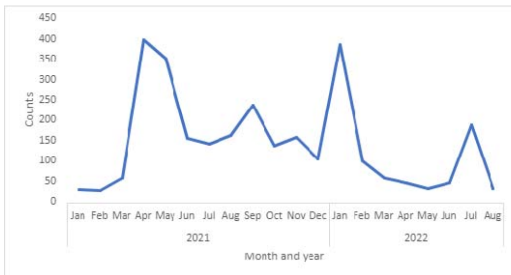
Figure 3: Monthly distributions of neutral and negative menstrual cycle posts on Reddit