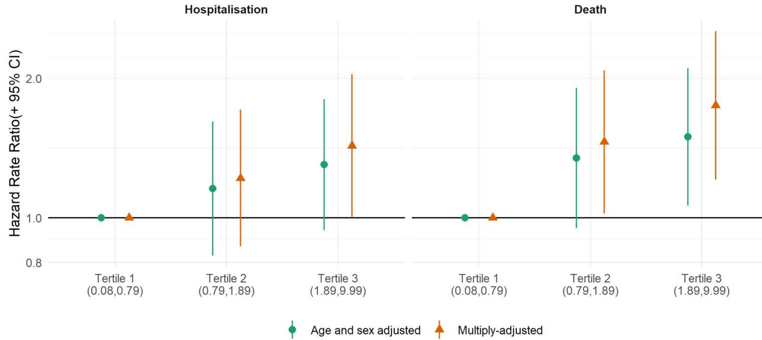
Supplemental figure 1. Association of C-reactive protein (2006-2010) with ALS risk (2010-2020) in UK Biobank (N=400,884)