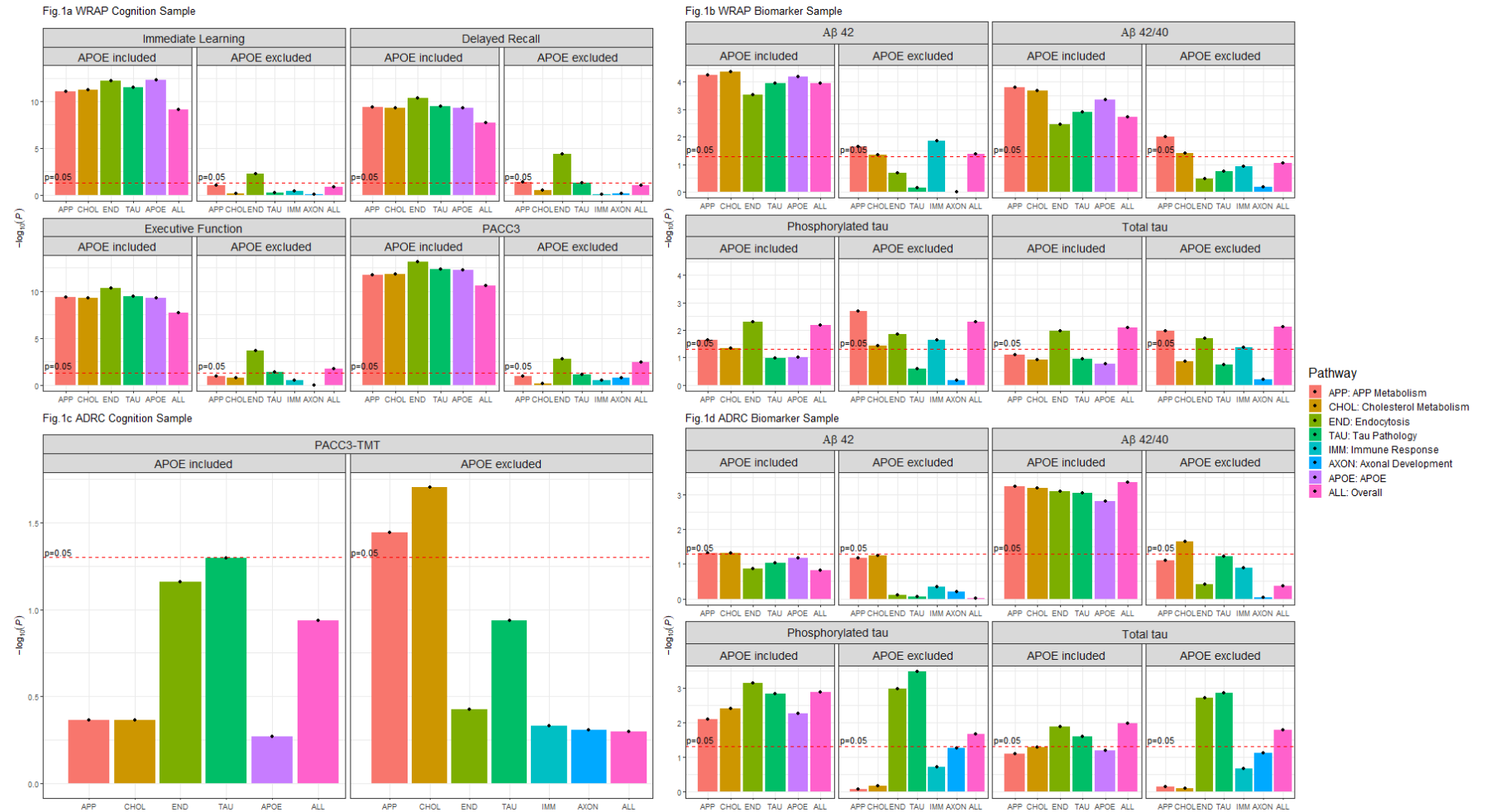
Figure 1 presents the -\log_{10}(P) from the likelihood ratio tests for the interaction between polynomial age and genetic risk for all outcomes in WRAP and Wisconsin ADRC. The likelihood ratio test statistic is calculated as the ratio between the log-likelihood of the nested model (model without interaction terms) to the full model (model with polynomial age*genetic risk terms). All association analyses are performed using the linear mixed effect model and adjusted for within-individual and within-family correlation. In addition to p-PRSs/PRS, age (linear, quadratic, and cubic), and their interactions, additional covariates include gender, education years, practice effect, and the first five genetic principal components of ancestry.