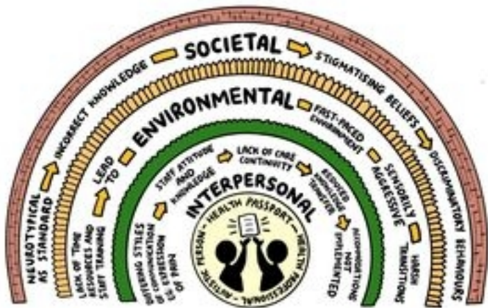
Figure 2: summary of