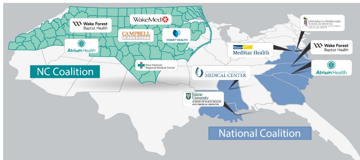
Figure 1. COVID-19 Community Research Partnership Site Locations