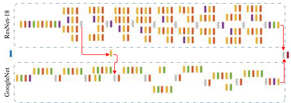
Fig. 2. Deep network fusion architecture ( case B ) with red arrows highlighting the fused layers (building box layers, blue for input image, yellow for convolution and fully connected layers, red for activation layers, green for dropout, purple for pooling, gray for layer manipulation, red for output layers)