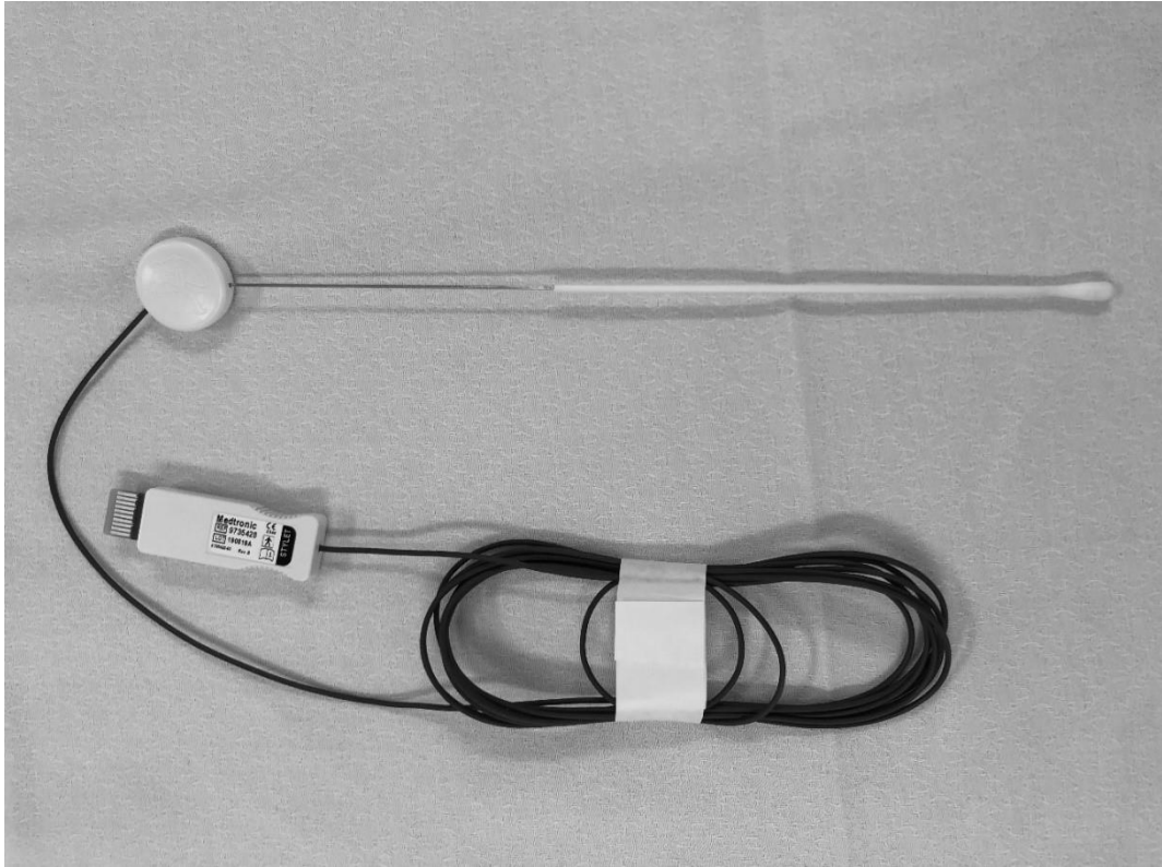
Fig.2 Figure 2: Navigated Swab Design