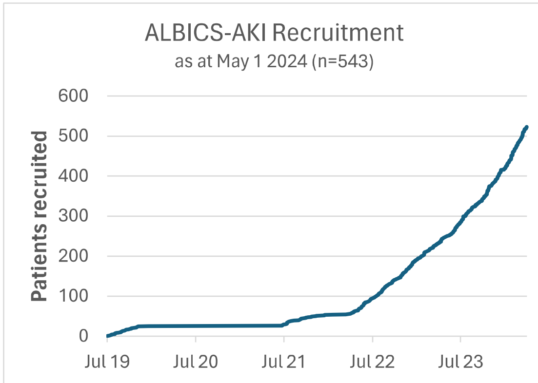
Figure 1 Recruitment progress over time, up to May 1 2024

Recruitment was halted during the COVID-19 pandemic between 2019 and 2021. More than 90% of patients were recruited after July 2022.