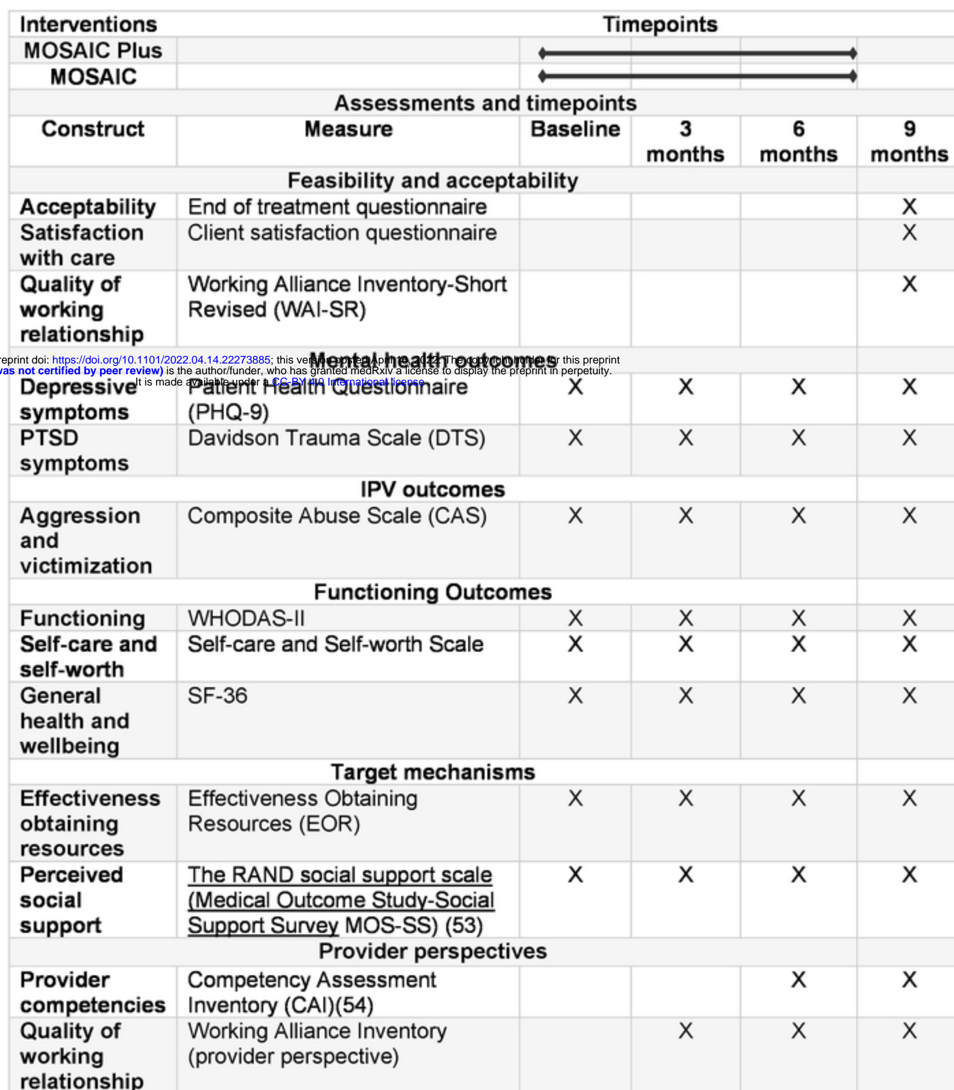
Figure 1: The SPIRIT Schedule