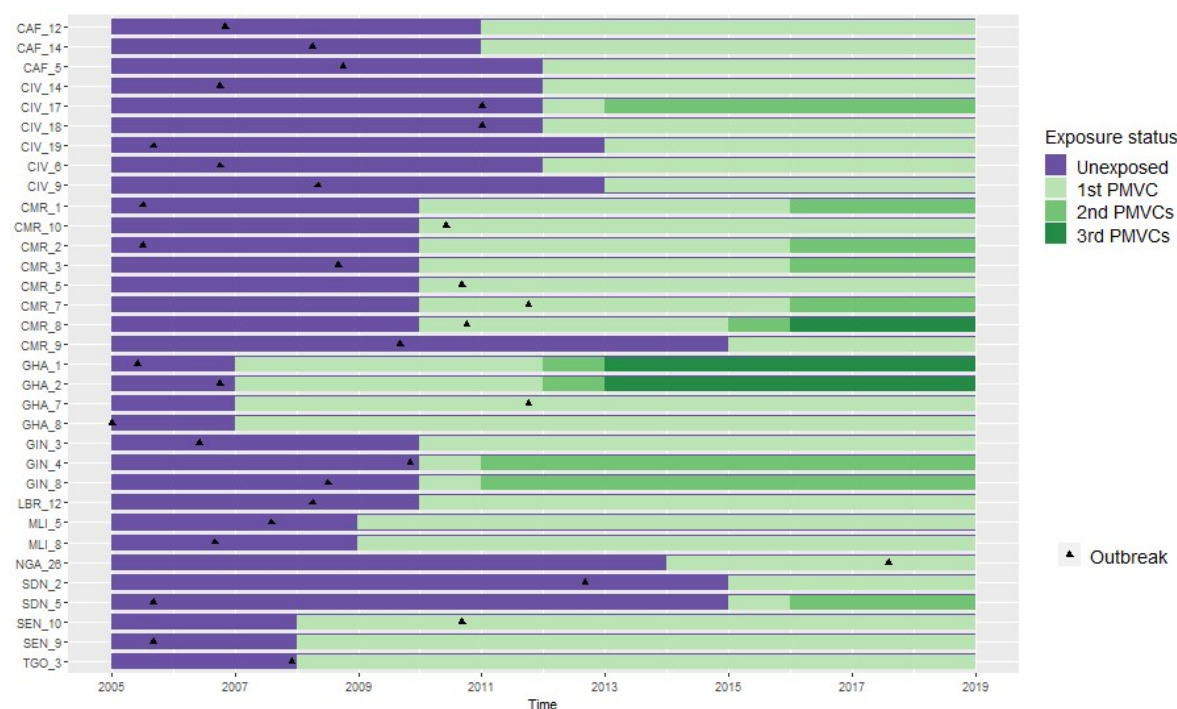
Figure 2: Swimmer plot of the chronology of exposure to preventive mass vaccination campaigns (PMVCs) and yellow fever outbreaks among the 33 exposed cases African provinces (2005-2018).

association was observed when considering all outbreaks instead of the first one only (IRR = 0.19, 95% CI 0.09 – 0.39) or when including a 3-year pre-exposure period (IRR = 0.14, 95% CI 0.05 – 0.40).