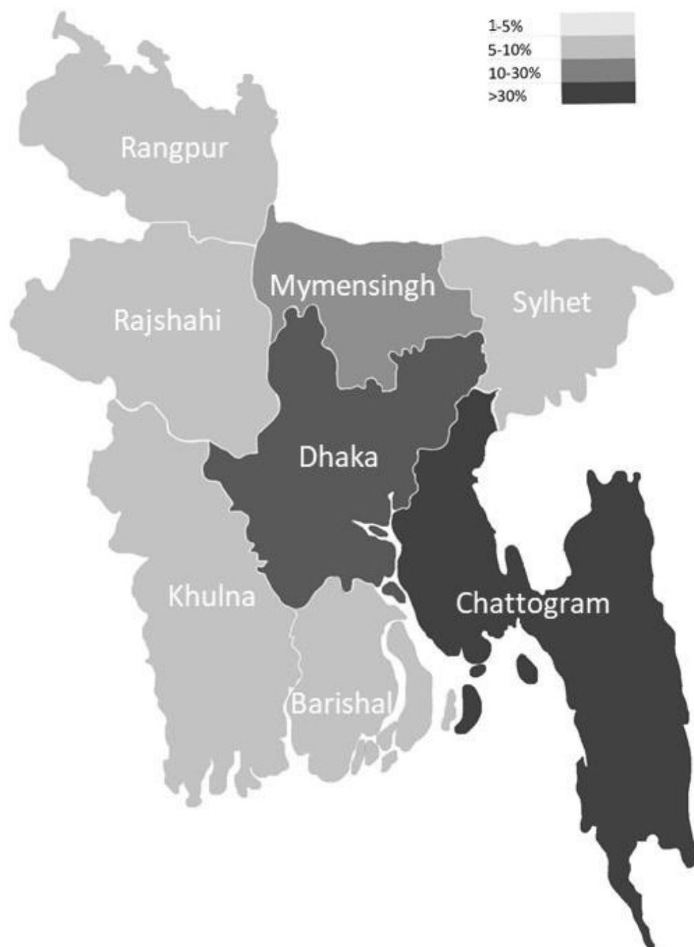
Fig. S1 Heatmap showing the administrative division-wise distribution of all the participants (n=2905)